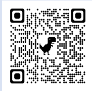
Reception / Year 1