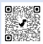
Years 2 & 3