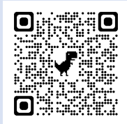
Reception / Year 1